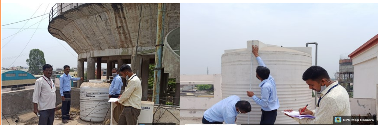
Designing and Manufacturing of Calibrated Scale