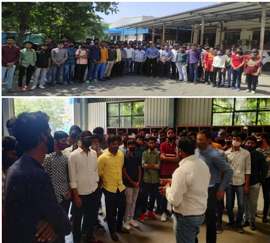
Students, Faculty and Company Executives during the Visit