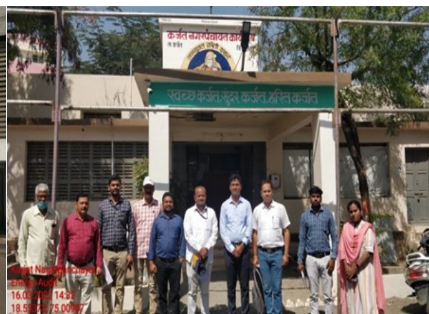
Karjat Nagar Panchayat Energy Audit 16.03.2022 14:22 18.58.17 75.00%