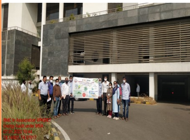
BMC in Association VPKBIET Energy Audit under MoU 16.03.2022 14:22 18.58.17 75.00%

Department of Electrical Engineering completed the Energy Audit as a part of MoU between VPKBIET, Baramati and Nagar Parishad, Baramati. All faculty of the Department and a few students of Electrical Engineering Department participated in carrying out the energy audit of several Municipal Buildings in Baramati on 7 January 2022. They also completed the Energy Audit of Karjat Nagar Panchayat on 16 March 2022. The efforts of faculty and students were appreciated by Nagar Parishad, Baramati.